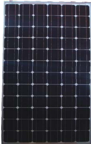
High Efficiency PV Modules