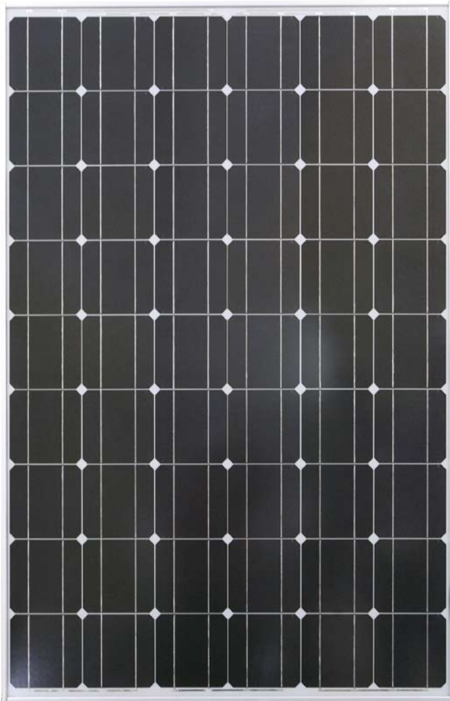
The photo is showing PCAxxx-A01