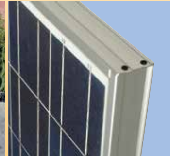
Tempered glass, EVA lamination and weatherproof backskin provide long-life and enhanced cell performance.