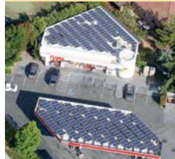
Sharp multi-purpose modules offer industry-leading performance for a variety of applications.

This module uses an advanced surface texturing process to increase light absorption and improve efficiency.