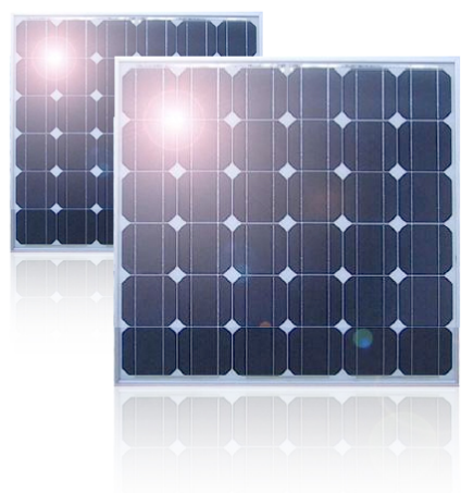
36 cells of 6" (156 mm x 156 mm) Monocrystalline - 140 Watts