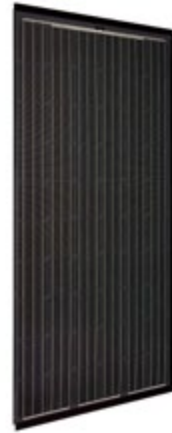
SITECNO MODULE BIPV