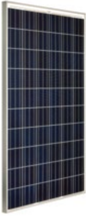
SITECNO MODULE Polycrystalline

Due to the unique combination of components, the high-efficiency modules from SITECNO are particularly powerful. With the high efficiency, the SITECNO offers maximum performance compared to the small overall area required. This also means: less effort and less material for installation. This increase in efficiency and the long-term high energy yields of SITECNO ensure efficient operation of your photovoltaic system. The quality of SITECNO module is continuously tested and confirmed by independent institutes. SITECNO modules are stored with a positive power classification. The performance is guaranteed by SITECNO for 25 years, the product guarantee is 10 years.