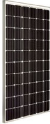
SITECNO MODULE Monocrystalline