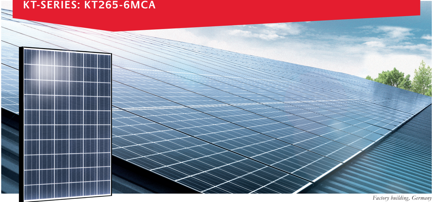
Factory building, Germany