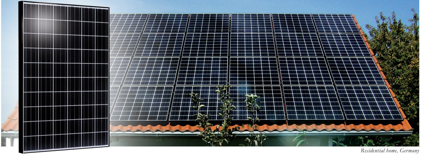
Residential home, Germany