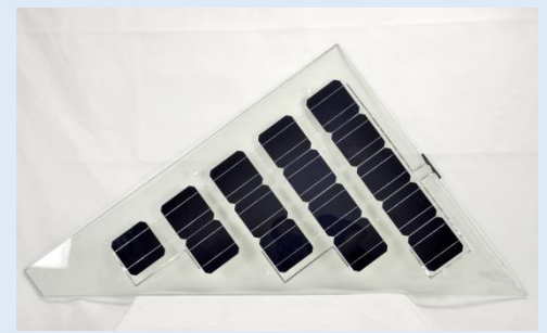
梯形 trapezoid BIPV