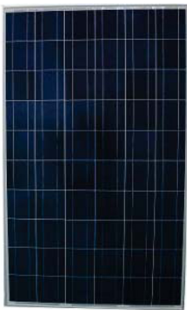
High Efficiency PV Modules