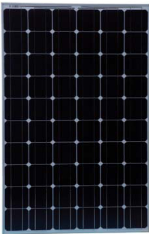
High Efficiency PV Modules