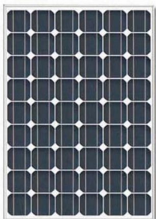
High Efficiency PV Modules