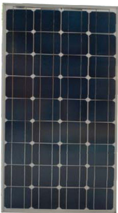
High Efficiency PV Modules