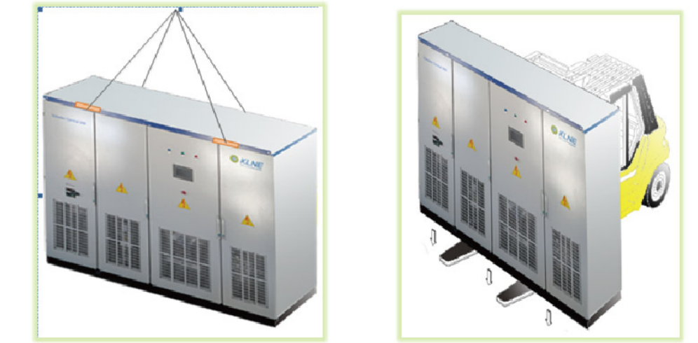
Two installation methods: crane lifting and forklift lifting which facilitate users in transportation and installation.