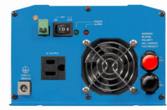
Phoenix Inverter 12/800 with Nema 5-15R socket