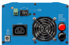
Phoenix Inverter 12/800 with IEC-320 socket