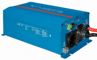
Phoenix Inverter 12/800 with Schuko socket

For our lower power models we recommend the use of our Filax Automatic Transfer Switch. The Filax features a very short switchover time (less than 20 milliseconds) so that computers and other electronic equipment will continue to operate without disruption.