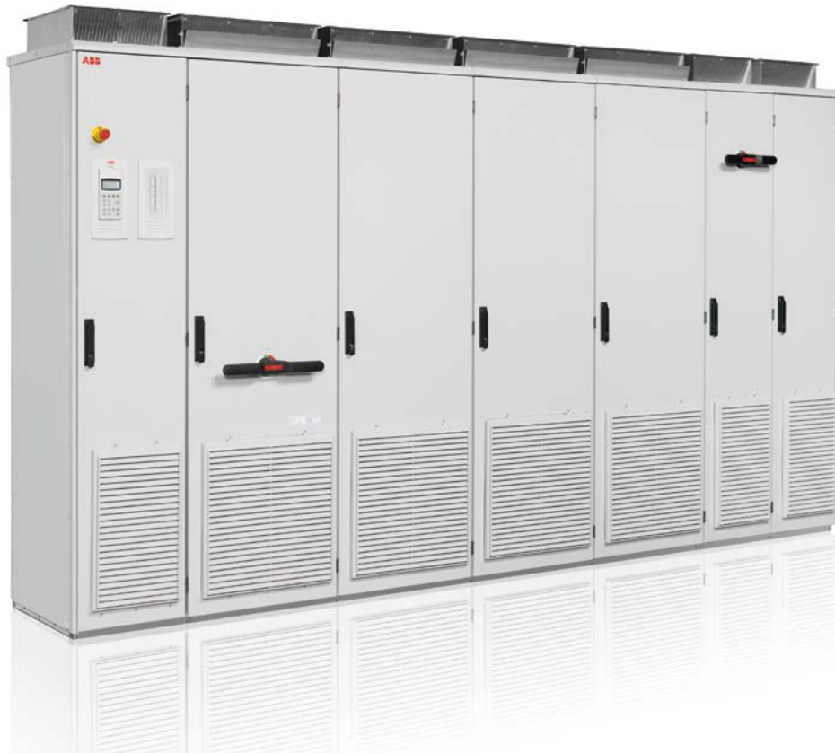
ABB central inverters raise reliability, efficiency and ease of installation to new levels. The inverters are aimed at system integrators and end users who require high performance solar inverters for large photovoltaic (PV) power plants. The inverters are available from 100 up to 1000 kW, and are optimized for cost-efficient multi-megawatt power plants.