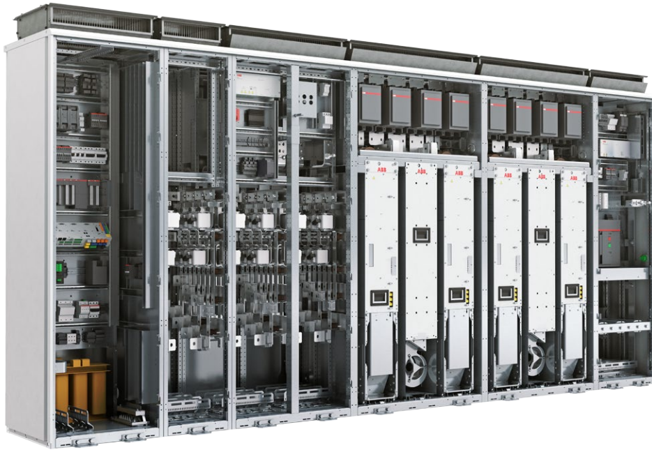
ABB central inverters PVS800-57B – 1645 to 1732 kW