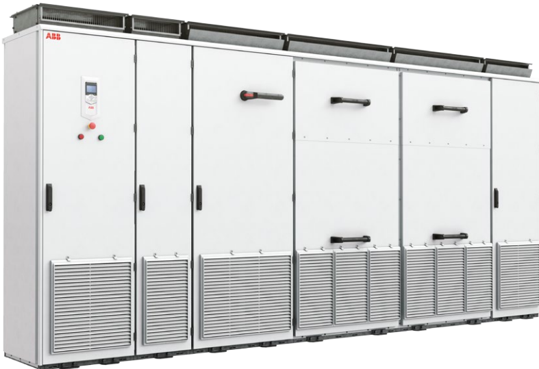
ABB central inverters raise reliability, efficiency and ease of installation to new levels. The inverters are aimed at system integrators and end users who require high performance solar inverters for large photovoltaic (PV) power plants. The inverters are available up to 1732 kW nominal rating, with 2078 kW output power at lower temperatures.