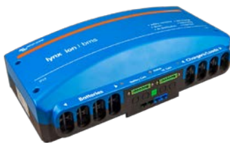
Lynx-ion BMS 1000A