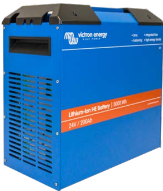
24V/200Ah HE battery