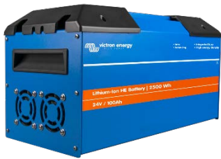
24V/100Ah HE battery