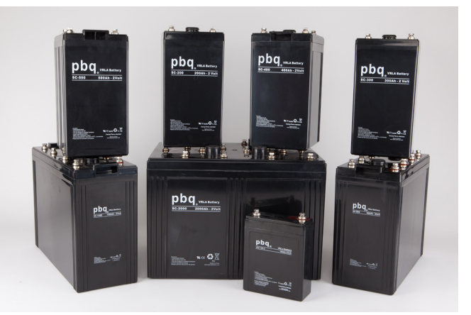
The SC family.