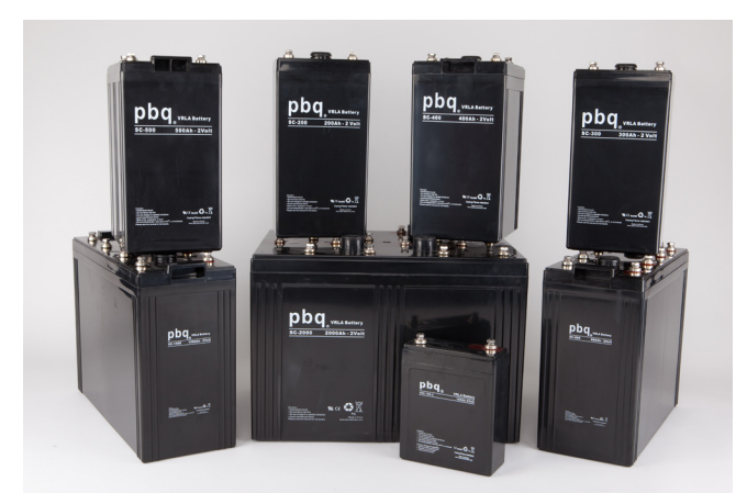
The SC family.