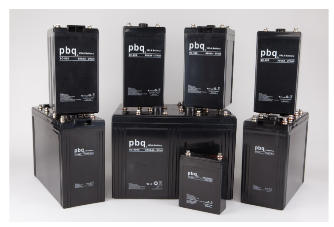
The SC family.