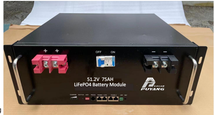
CYCLE LIFE vs. DEPTH OF DISCHARGE(DOD)