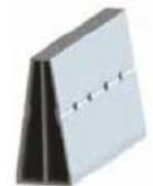
130 Rail Splice