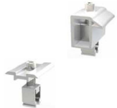
Universal Mid/End Clamps