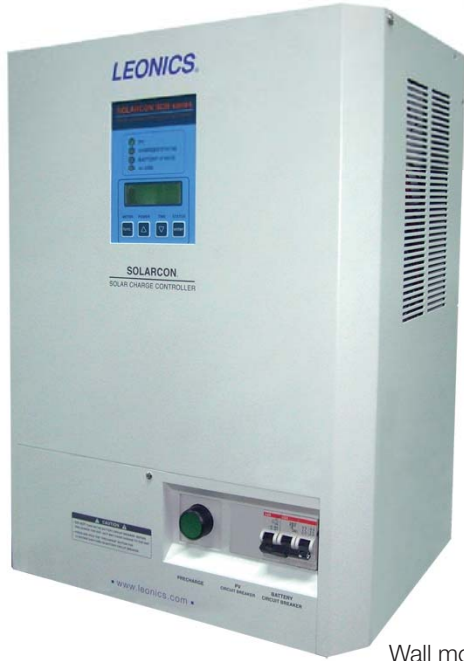
Wall mount type