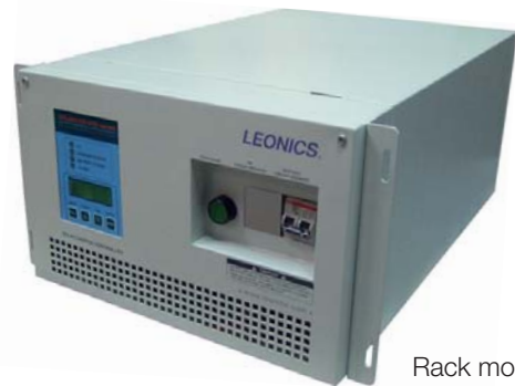
Rack mount type