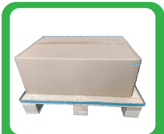
Dimensions: 825*680*250mm Weight: 109Kg