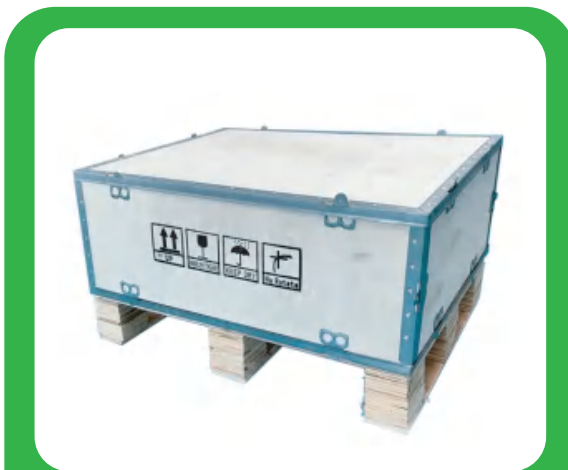
Dimensions: 865*720*400mm Weight: 135kg