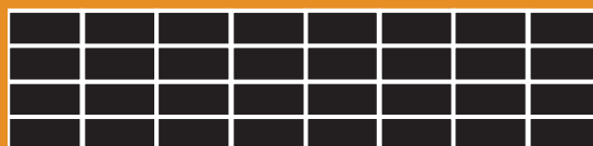
3-4 Rows x Columns