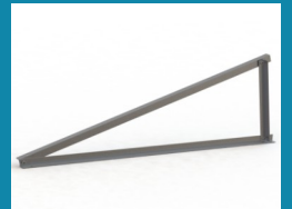
5. Triangular Mounting System