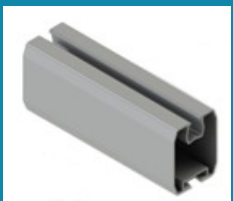
1. Pv Rail