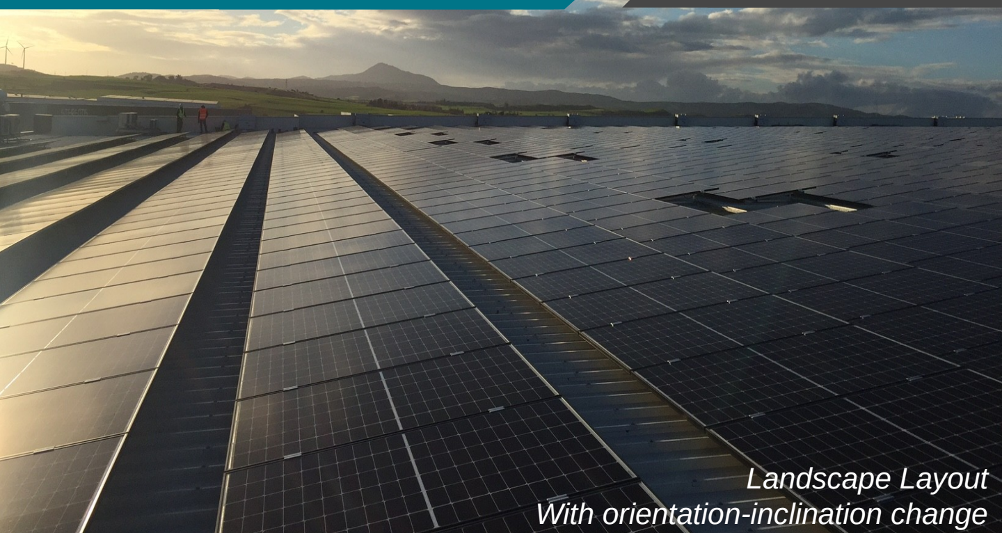
Landscape Layout With orientation-inclination change