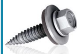
4. Bi-Metal Screw