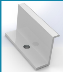
2. End Clamp