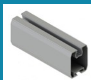
3. PV RAIL