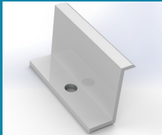
1. END CLAMP