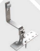
B:Adjustable Pantile Roof Hook