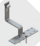
A:Pantile Roof Hook