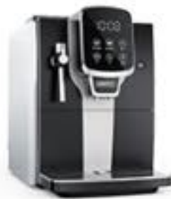
Coffee making machine