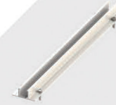
B:Mini Rail (panels in portrait)