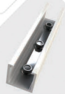
A:Mini Rail(panels in landscape)