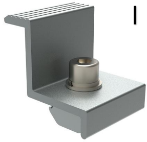
XHF-EC-40, 40mm end clamp