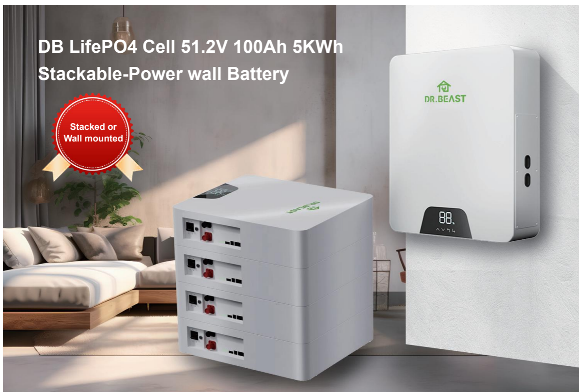
DB LifePO4 Cell 51.2V 100Ah 5KWh Stackable-Power wall Battery