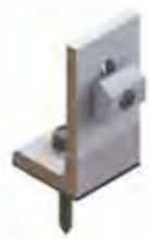
Tin Interface Kit L feet 1# Type KS-HK-L01-ZS80