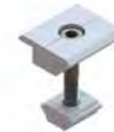
End Clamp KS-EC2-F40