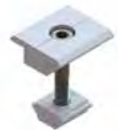
End Clamp KS-EC2-F40