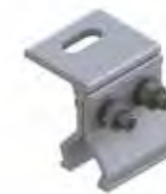
Standing Seam Hook #4 KS-HK-S04