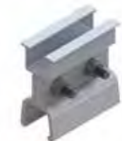
Middle Clamp KS-IC2-F40