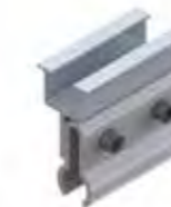
Middle Clamp KS-IC2-F40