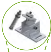
Adjustable Front Leg KS-AJ-FL