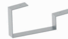
压载后角 Mid foundation