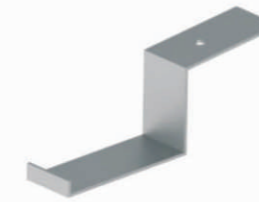
压载前角 Solarballast -I Front foundation