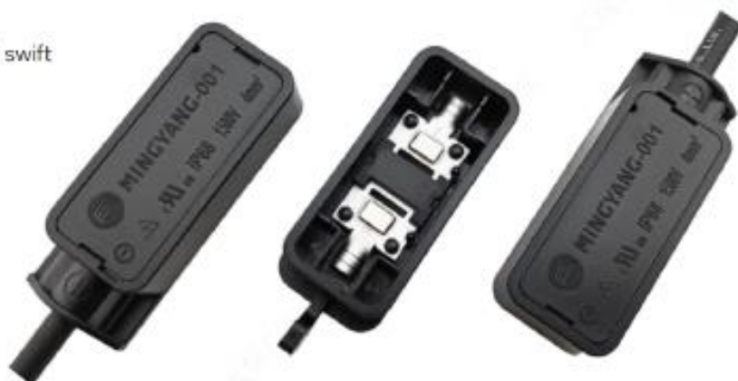
产品参数 PRODUCT PARAMETERS