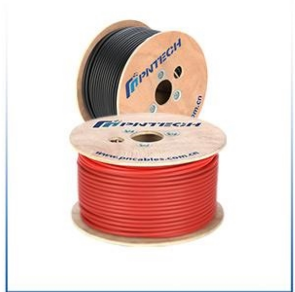
Wooden pallet packing