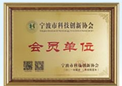
Member of the Association for Science, Technology and Innovation (ASTI)