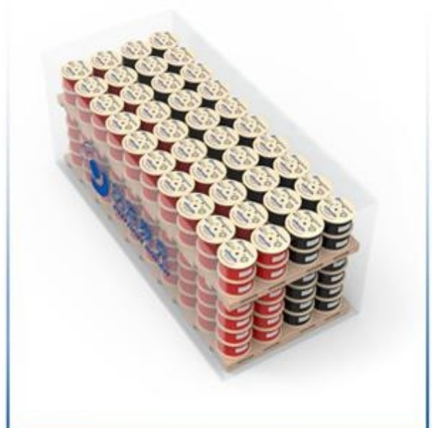
Schematic diagram of loading cabinet