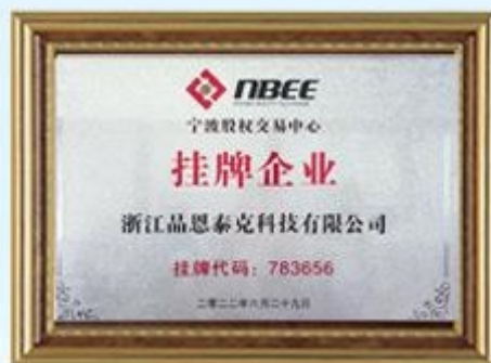
Equity listed companies