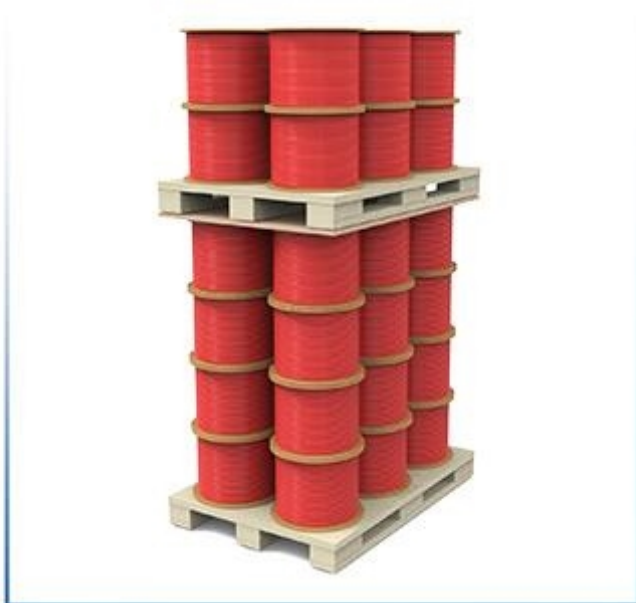
Wooden pallets + pallets