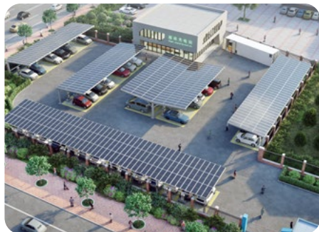
Solar-plus-storage and EV Charging Carport