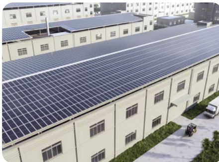
Flat-to-pitched Roof Conversion