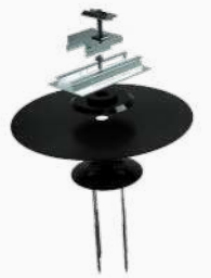
Roof Solar EPDM