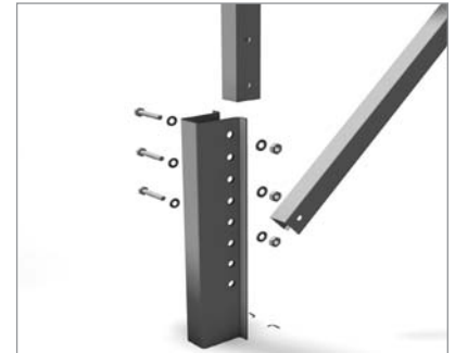
Connection detail: post