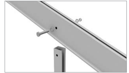
Connection detail: leg - rafter