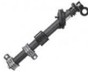
Bayonet fuse holder