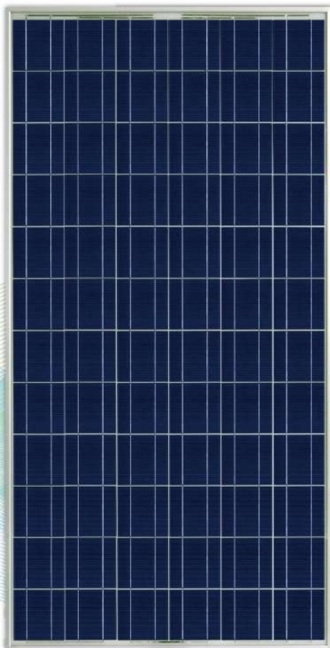
6" Poly-crystalline Solar Cell, 6x12pcs