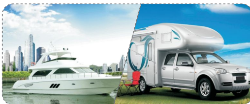
Marine & RV