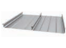
Standing Seam Roof