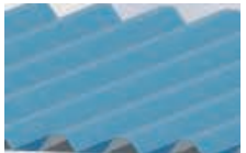
Kliplok Roof System