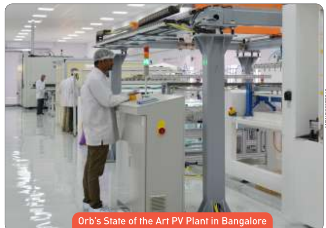
Orb's State of the Art PV Plant in Bangalore