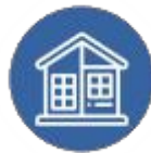
Home energy storage system