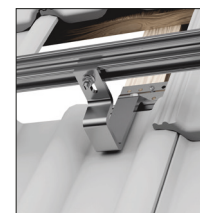
Double Roman Tiles