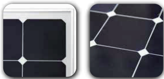
— Product details —