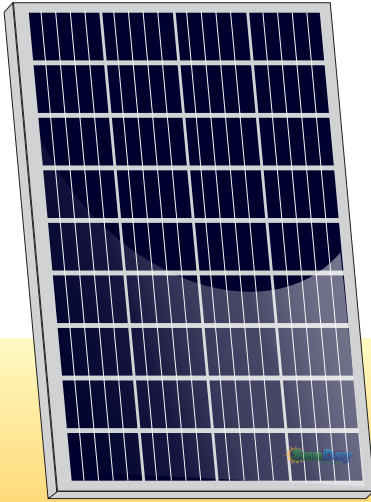
SOLAR MODULE: SDP-100, SDP-105